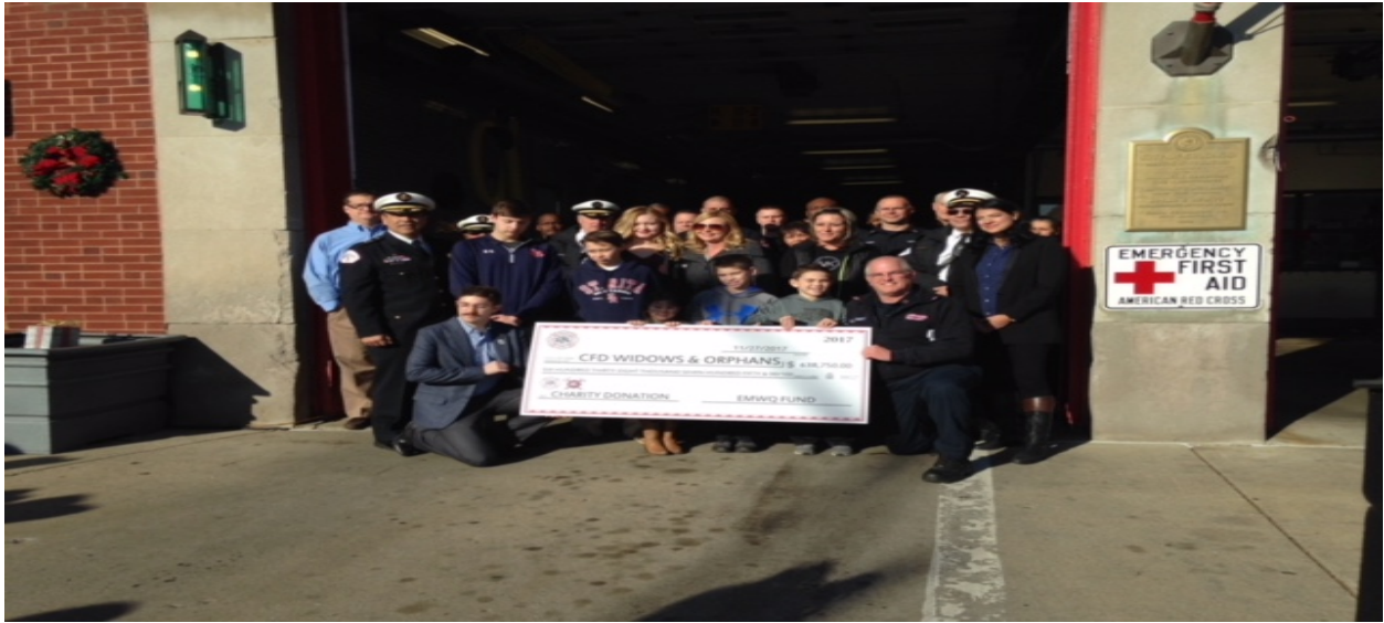
Photo taken at Engine 92's House on December 3, 2017

I would like to extend the “Board’s” gratitude to the men and women of the CFD as well as all of our supporters for their generosity in supporting our neediest members. Thanks to all of you, we were able to distribute $638,750.00 to our neediest widows and children this holiday season.